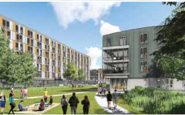
Rowan University Renderings