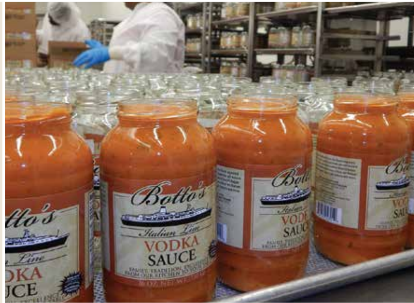
Domestic and international food processors will gain access to their very own manufacturing space as well as shared freezer, refrigeration and warehousing space after developing product lines and services at the County's new Food Commercialization Center.

The project is planned to be constructed using the existing infrastructure of Bridgeton’s Florida Avenue Industrial Park, where the Rutgers Food Innovation Center is currently located. In its partnership agreement with the center, the CCIA will develop and manage the project with support from the US Economic Development Authority.