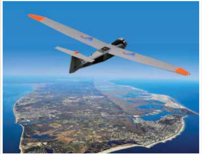
A fixed-wing drone produced by American Aerospace Technologies, Inc. (AATI) is pictured above the Cape May Peninsula. AATI is one of the companies settling in Cape May County to conduct drone-related business.

Designated by Congress as one of six official test sites in the nation for flights of unmanned aerial systems, or drones, Cape May County is in an enviable position. The county was chosen because of the relatively quiet surroundings, equidistant to Washington, D.C., Philadelphia and New York City and the proximity of the FAA Technical Center in Atlantic County. The potential market is forecast to generate more than 100,000 jobs and over $82 billion nationwide by 2025. In mid-2015, it hosted the first commercial test campaign launched at a New Jersey public airport, and continues to develop into an active site for UAS flights and testing by corporations and universities. The County also has applied for permission to fly its own drone missions on County projects like bridge inspections, coastal assessments, emergency response, and construction project monitoring.